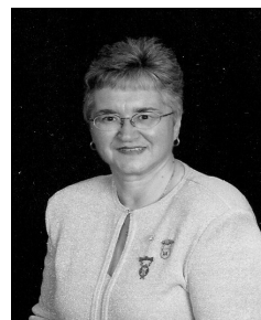
From the Supreme Secretary's Desk